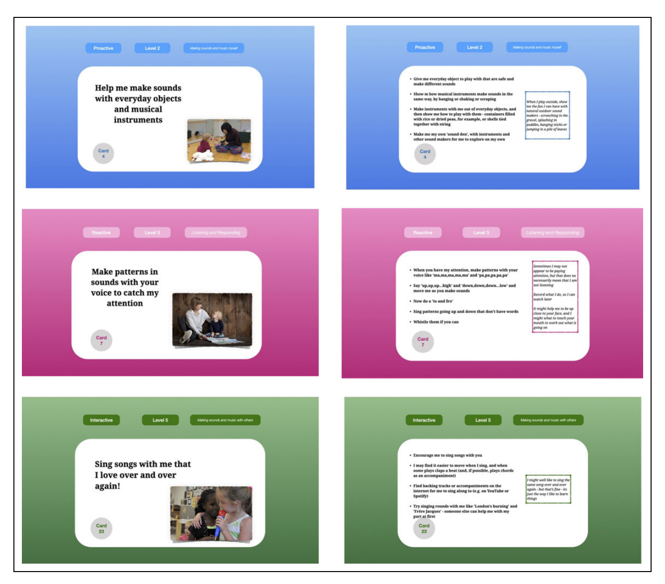
Figure 2. Examples of a proactive, interactive and reactive card.